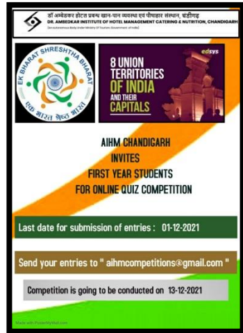
E-Invite for the entries